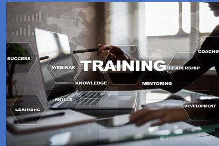
TAE50216 Diploma of Training Design and Development