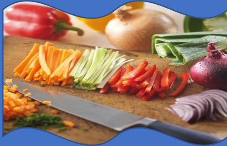
SIT30816 Certificate III in Commercial Cookery SIT40516 Certificate IV in Commercial Cookery