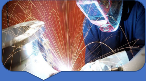
MEM40119 Certificate IV in Engineering (Welding)