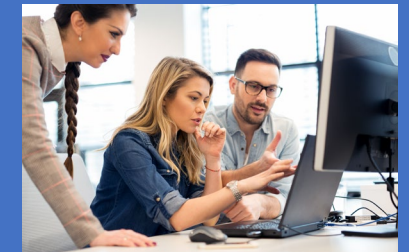
BSB50120 Diploma of Business