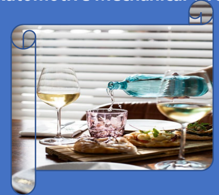
SIT30622 Certificate III in Hospitality SIT50422 Diploma of Hospitality Management