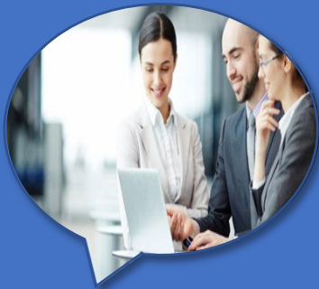
BSB80120 Graduate Diploma of Management (Learning)