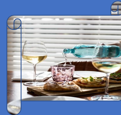
SIT30616 Certificate III in Hospitality SIT50416 Diploma of Hospitality Management