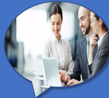
BSB80120 Graduate Diploma of Management (Learning)